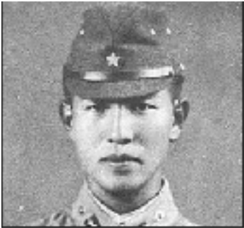
Onoda as a young man.

Hiroo Onoda was an Imperial Japanese Army intelligence officer. He was trained at the Nagano School. He fought in World War II and didn't surrender in August 1945.