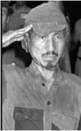
Onoda, saluting to the Japanese flag.