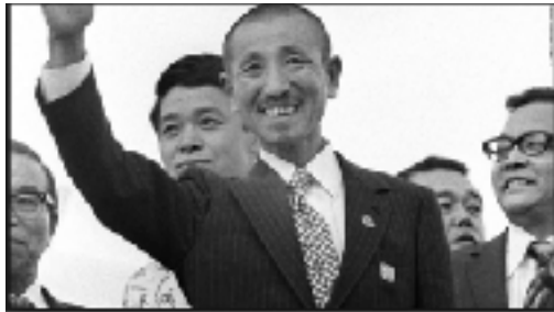
Here in this picture, Onoda has come back to Japan on an airplane.

Finally, when he returned to Japan, he was very popular, but he found it hard to adjust to the new Japan. He found it hard that it had decayed from its traditional values. He made an autobiography and in 1975, he left Japan for Brazil. There, he raised cattle and later opened many series of training schools. In his last years, Onoda said in an