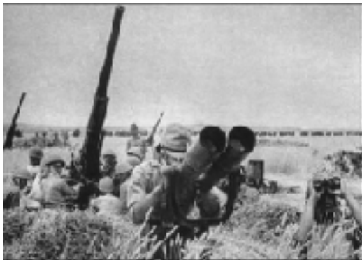
Here in this photo, you see Japanese defenses alert to an American air attack in Luzon in 1944.

He said to Onoda “It may take three years, it may take five, but whatever happens to you, we will come back for you. Until then, so long as you have one soldier, you are to continue to lead them.”