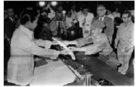
Here, Onoda gave his Samurai sword, family dagger and more weapons as part of his surrender.

Taniguchi. In March 1974, his former commanding officer travelled to the Philippines to fulfill his promise to return, and end his orders in person. The Philippine government, who was President Ferdinand Marcos, granted him a pardon, although he killed 30 innocent people on the island.