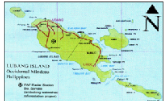
This is the Lubang Island where Hiroo was sent.

Hiroo Onoda was sent to the Lubang Island, near Luzon, in the Philippines in late 1944. He met up with a group of other Japanese soldiers on the island. A man named Major Yoshimi Taniguchi had given him orders to live off the land, and refused him to die by his own hand.